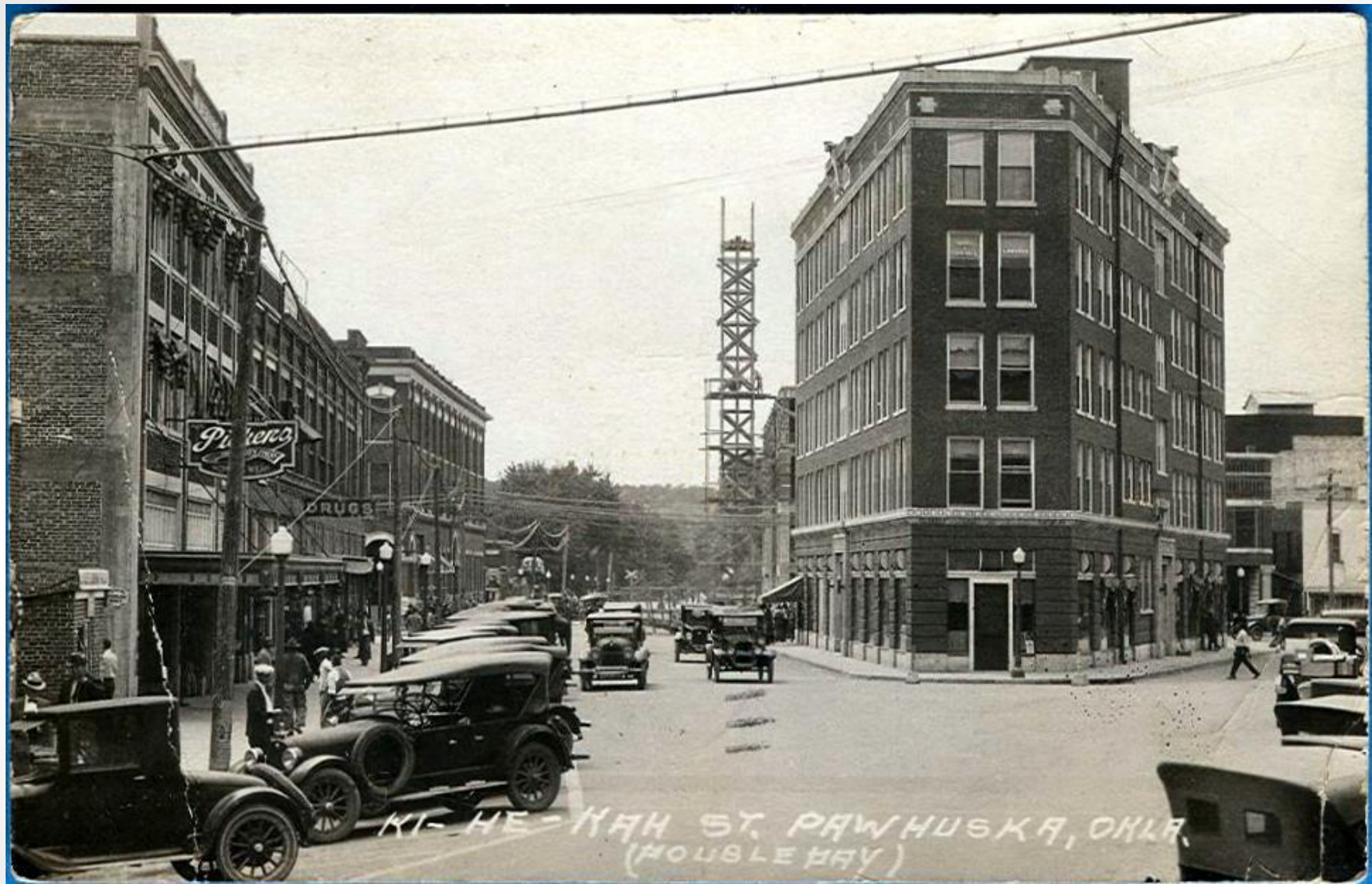
KT-HE-KAH ST. PAWHUSKA, OKLA. (HOUSE HAY)