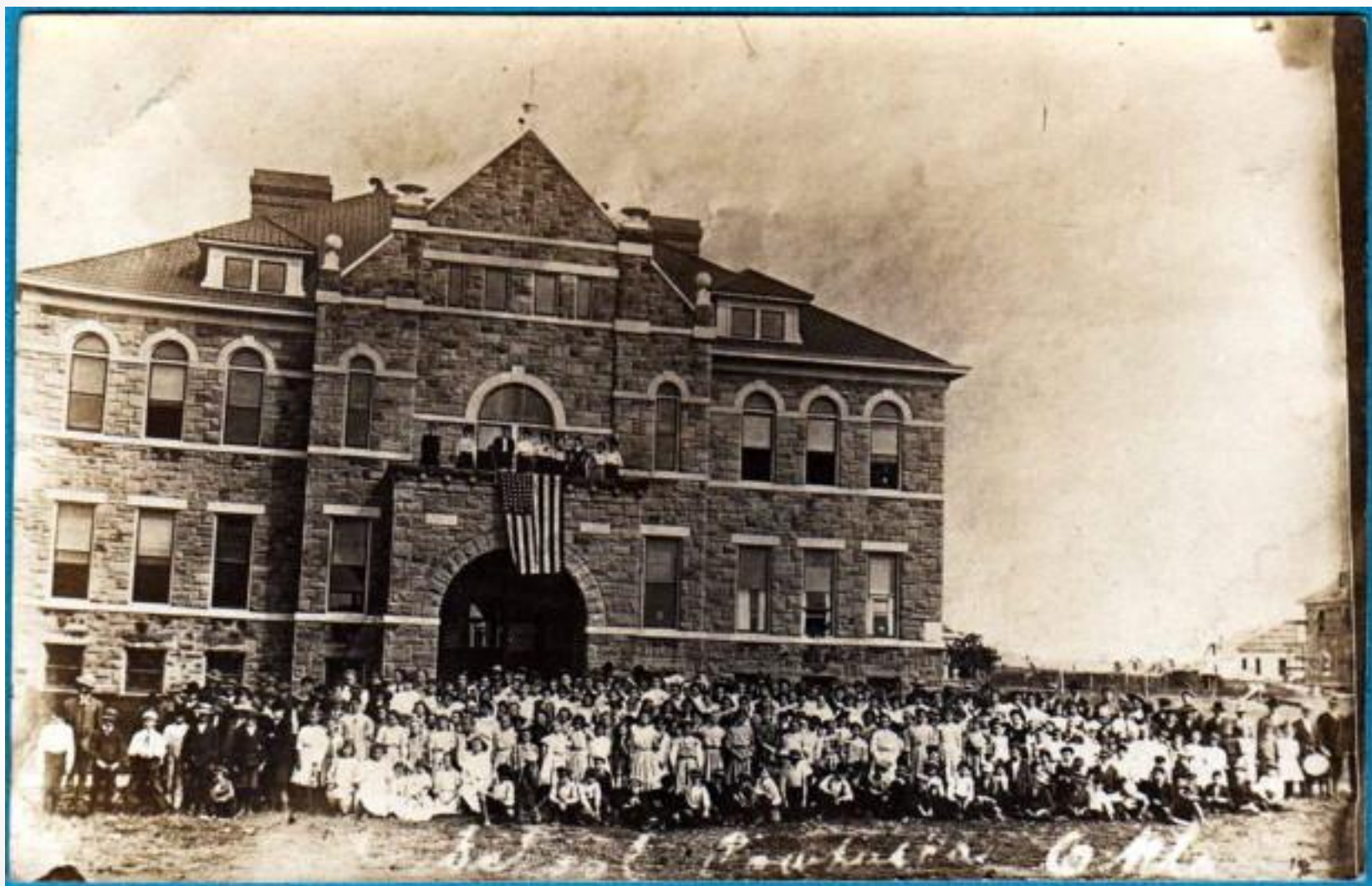
St. Paul's Episcopal Church