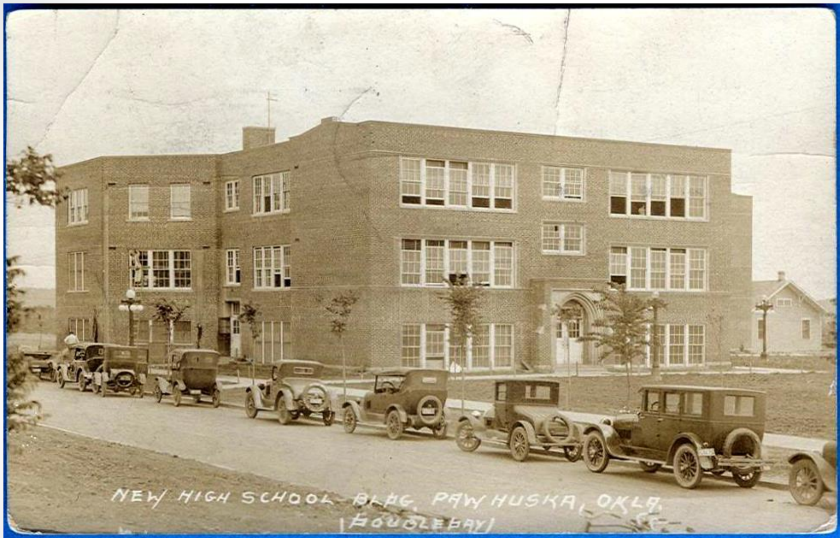
NEW HIGH SCHOOL BLDG. PAW HUSKA, OKLA. HOOGLERAY