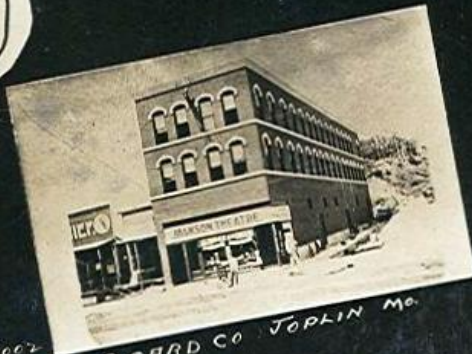
10002 C. C. CARD CO JOPLIN Mo.