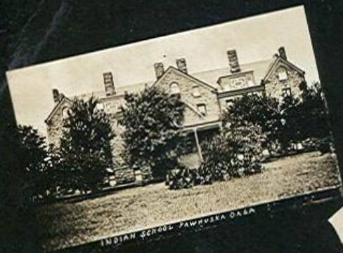
INDIAN SCHOOL PAWHUSKA OKLA