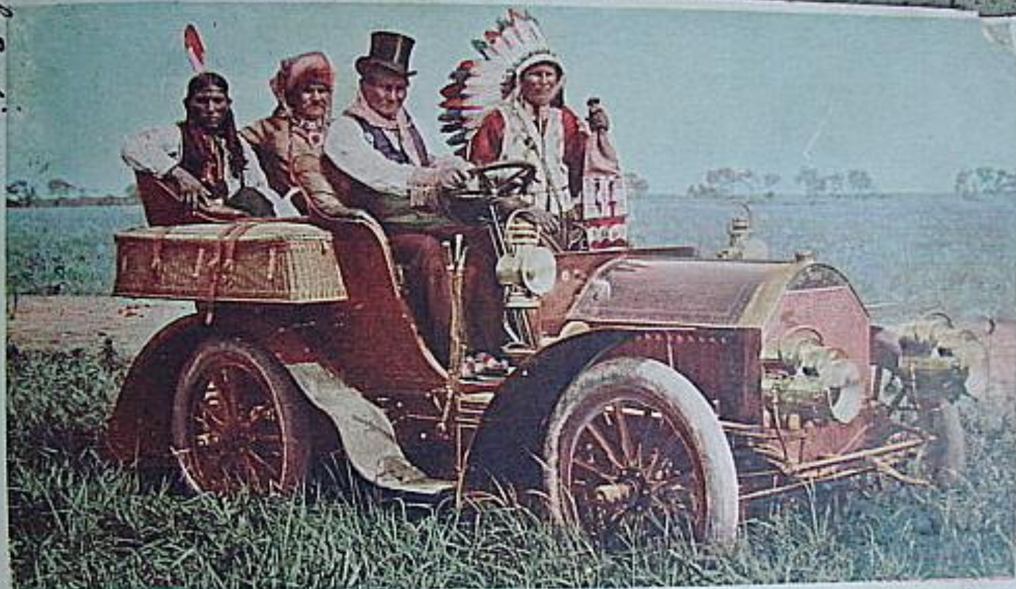
225. Indians Up-to-Date.

Ran Luoka Ind. for 6/11. A large number of Indians in town today to get their quarterly pay. Paha